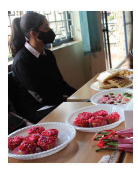
Preparations for the Valentine Day celebrations in high gear