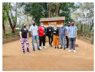
All set for the day...

The day was full of fun and adventure. Kudos to the organizers!