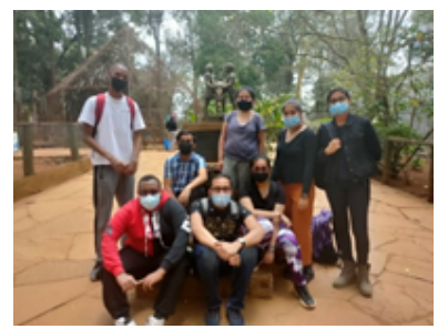
Time for a group photo before embarking on the tour of the Orphanage

"One of the first conditions of happiness is that the link between man and nature shall not be broken." — Leo Tolstoy