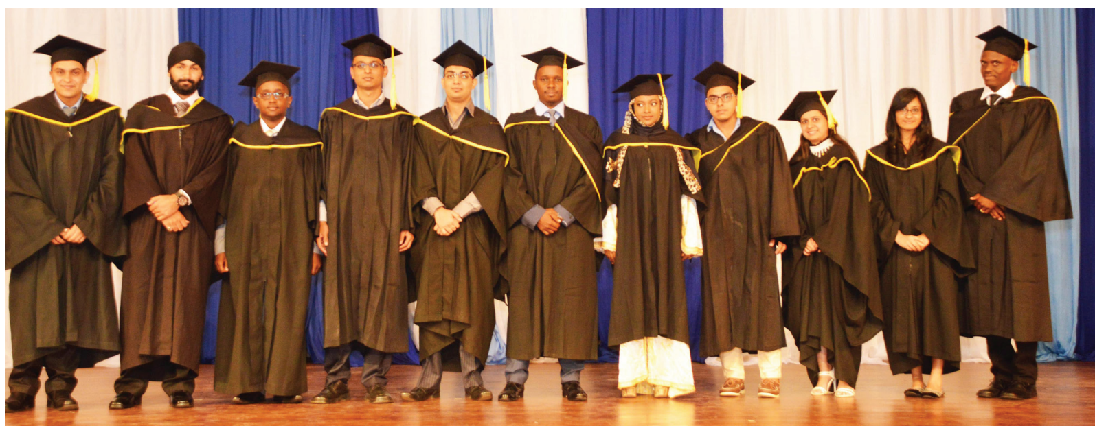
A group photo for class toppers in BSc (Hons)-Computing degree

“History has demonstrated that the most notable winners usually encountered heartbreaking obstacles before they triumphed. They won because they refused to become discouraged by their defeats.”-B. C. Forbes