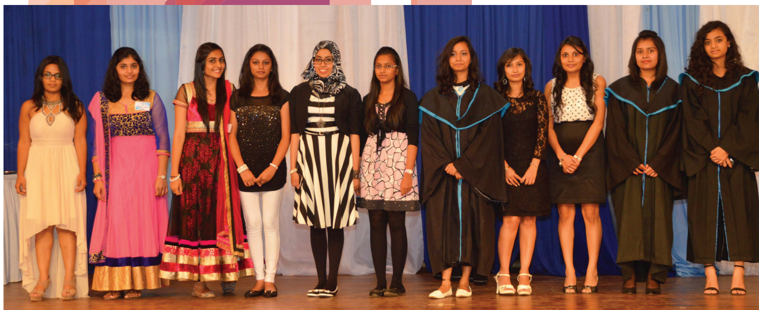
A group photo for class toppers in ABE Diploma in Business Management

Speaker after speaker applauded the Graduands for attaining this remarkable milestone, parents and guardians for being active partners in the education of their children, and the College management for creating a wide range of opportunities within and beyond the classroom in order to facilitate study, learning and holistic development of students.